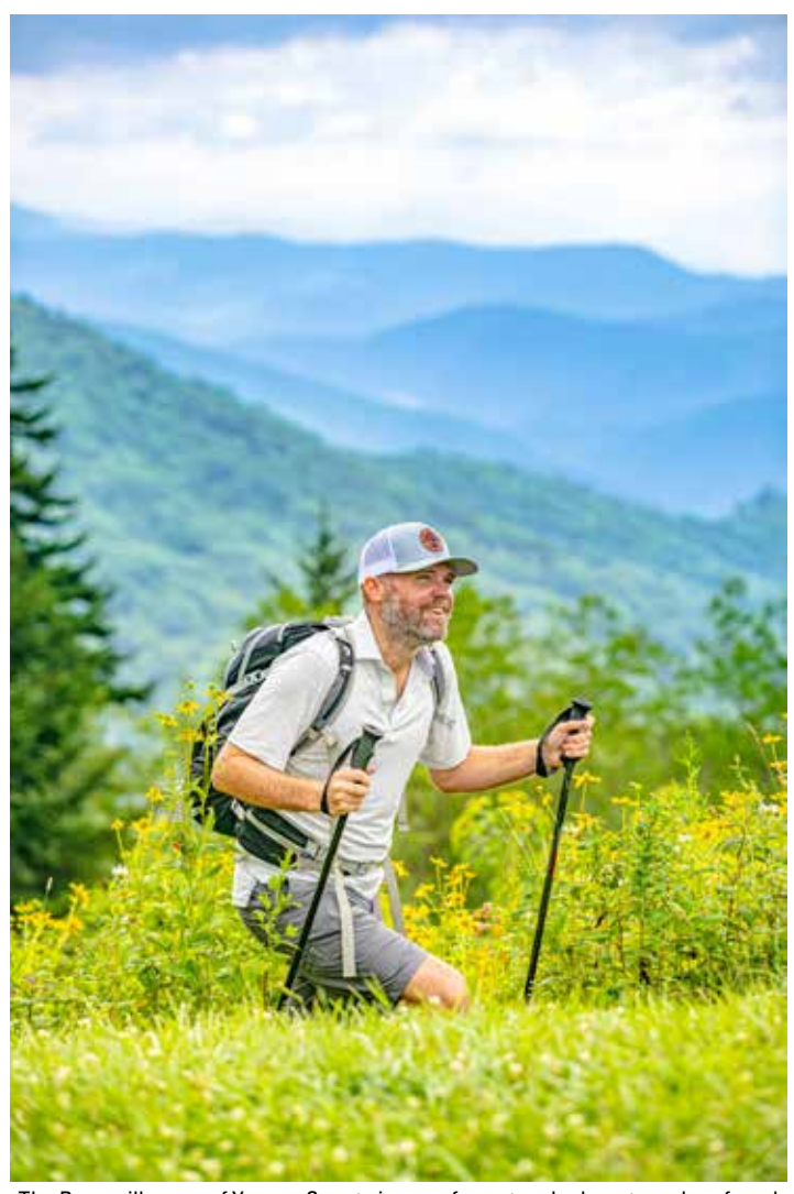
The Burnsville area of Yancey County is one of spectacular beauty and profound landscapes, offering some of the best hiking opportunities in the country.

Utilizing what they've dubbed "The Burnsville Connector," Jake Blood and Jennifer Pharr Davis have established the Appalachian High Route, a 343-mile loop that combines the Appalachian Trail, Mountain-to-Sea Trail and Black Mountain Trail.